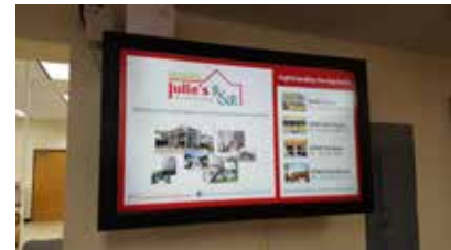
Locations and availability are subject to change.