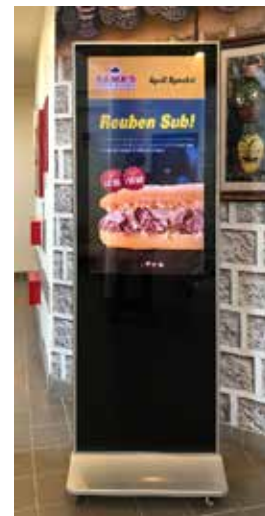
Locations and availability are subject to change.