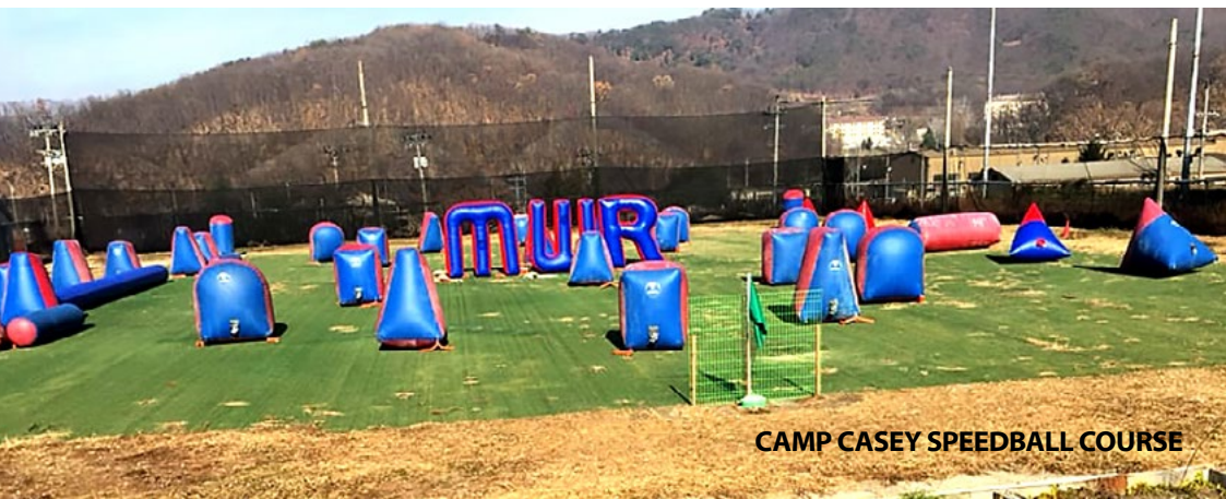
CAMP CASEY SPEEDBALL COURSE